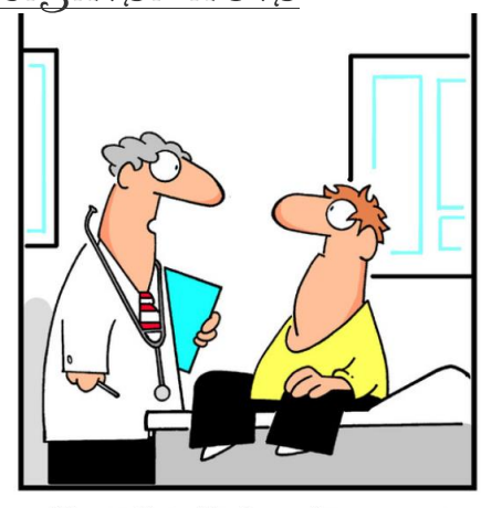
"Yes, garlic and herbs can improve your cholesterol...but not garlic and herb potato chips."