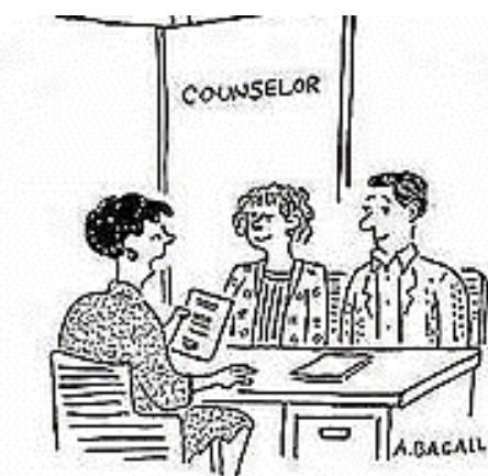
"His music teacher says he has van Gogh's ear for music."