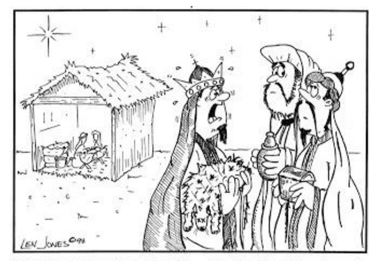
"That can't be right! I distinctly heard you say Gold, Frankincense and Fur!!!"

To ensure that a mass time is available please telephone the parish office to make a booking.