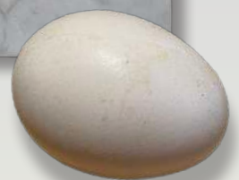
Submitted by Eric French