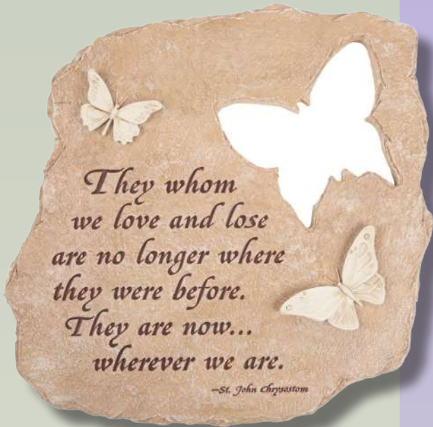
St John Chrysostom

“When the last tree is cut, the last fish is caught, and the last river is polluted; when to breathe the air is sickening, you will realise, too late, that wealth is not in bank accounts and that you can't eat money.”