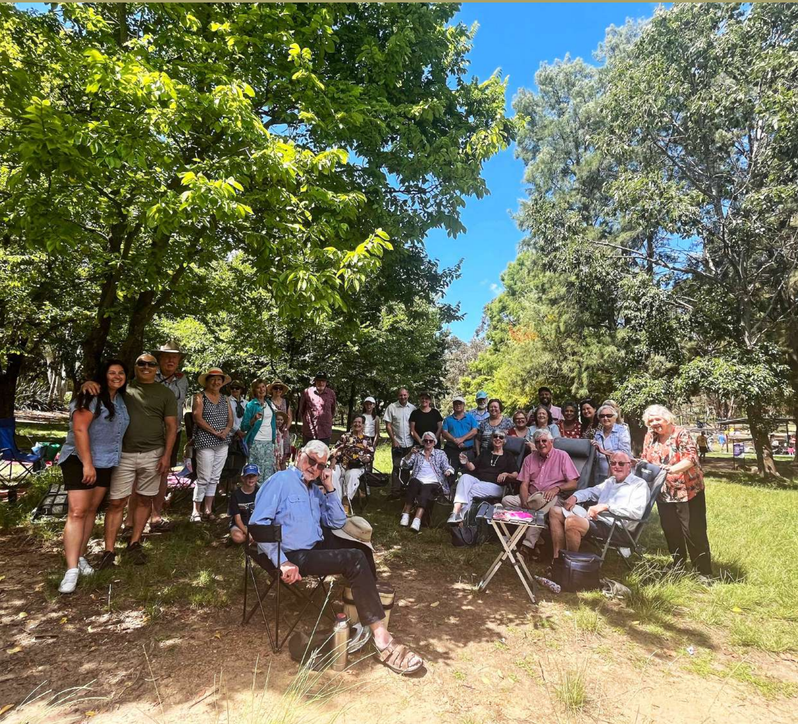
Group photo of the Parish Picnic held on 26 February 2023